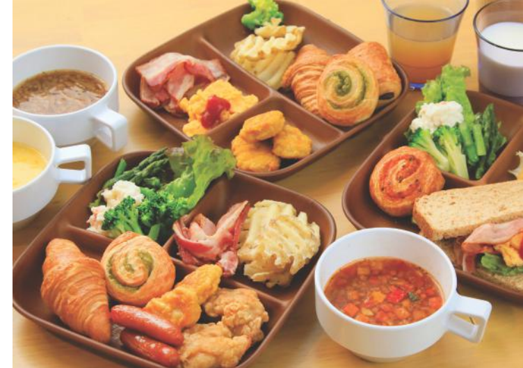
Breakfast example. Menu changes daily.

Coin-operated laundry is located on site.